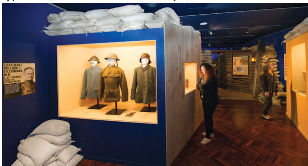
The Exhibit at the New Haven Museum

In the huts, soldiers had the opportunity to attend Mass, go to confession, hear a music recital, see vaudeville entertainment, or watch a movie. They could attend a dance, sit ringside at popular boxing competitions, write letters home (the Knights provided 1,800 tons of stationary), or read a book from the library.