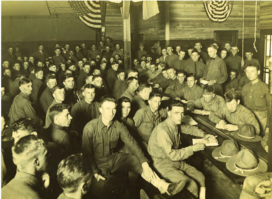
Soldiers Writing Letters at the Knights of Columbus Hut, Camp Gordon, GA

On 14 April eight days after the United States entered the war, the K of C board of directors passed a resolution, which was sent to President Woodrow Wilson. It assured the president that “the crisis confronting the nation hereby reaffirms the patriotic devotion of 400,000 members of this Order in this country to the Republic and its laws and pledges their unconditional support to the President and Congress.”